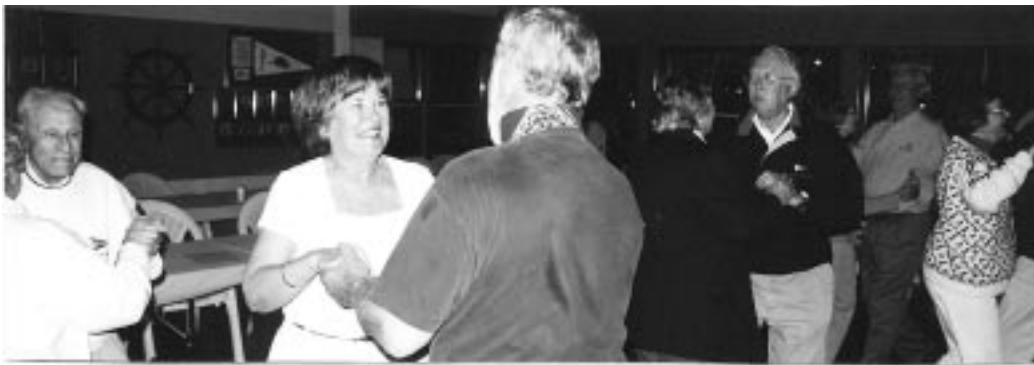
Sailpast Dance ... Sailors can dance!