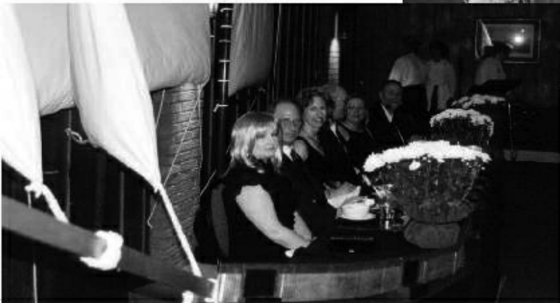
Left: View of Head Table