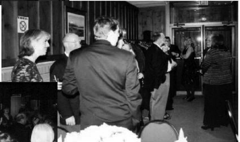
Right: Receiving Line Welcome