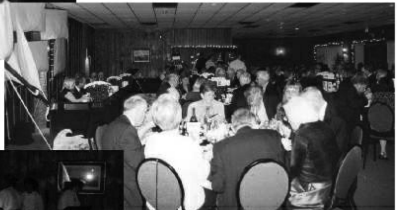
Above: Dinner Attendees