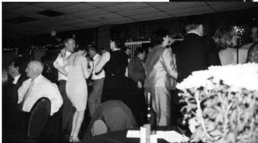
Above and left: Dancing until the 'Wee hours' to music arranged by 'Kruz' Radio