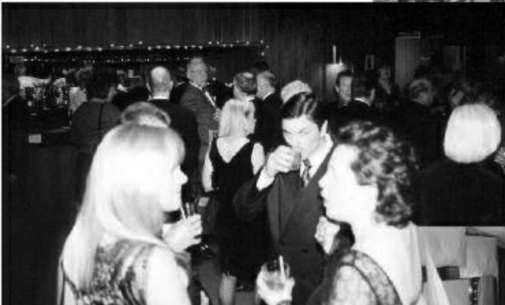
Above: Cocktail gathering at the Ball