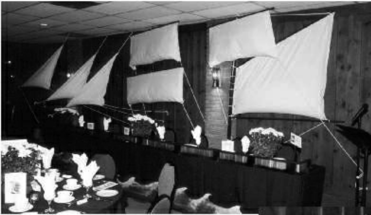
Above: Tall Ship Head Table View