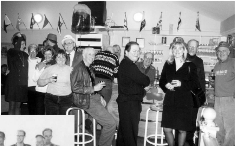
Top: Some of the revellers who 'tipped' a couple at the Crow's Nest to St. Patrick's Day.