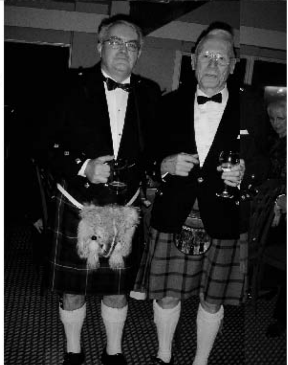
Lower Right: Service with a smile...