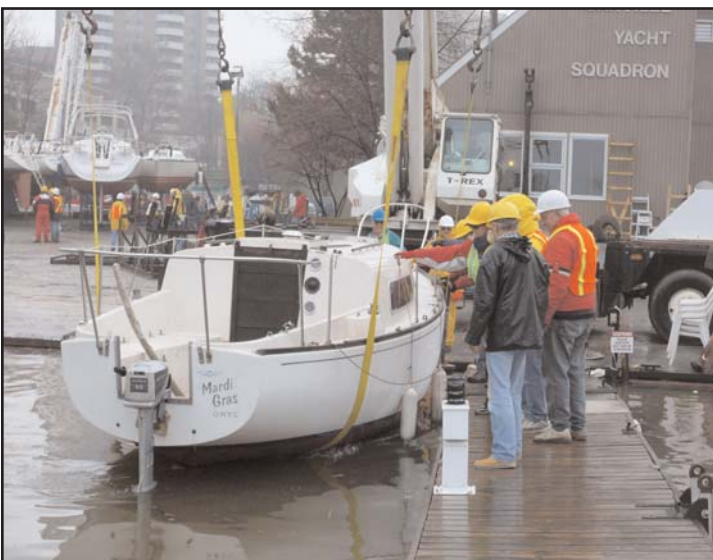
She is good to go!