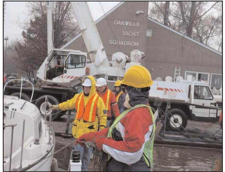
Is it lunch yet?