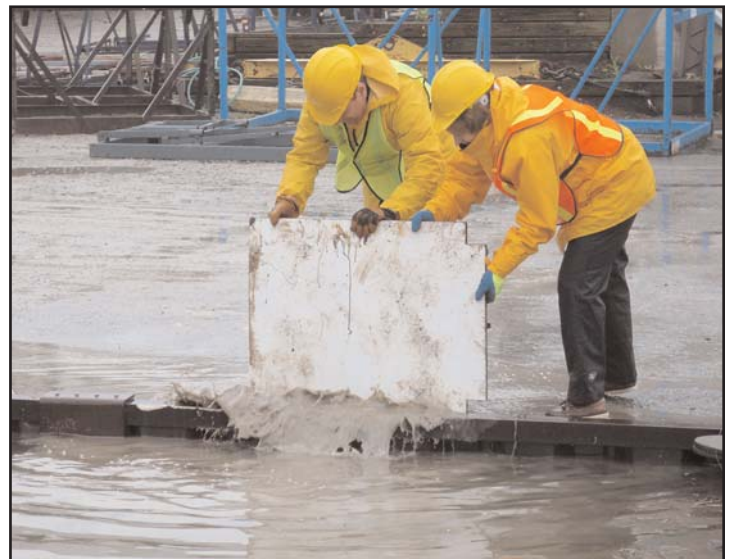
We are getting flooded