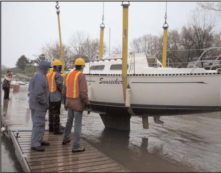
Easy does it!