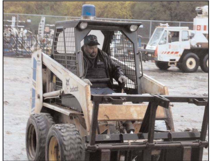
Keeping cradles in order!