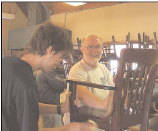
Men cleaning the chairs