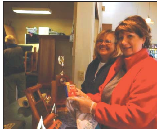
Ladies cleaning the Trophies